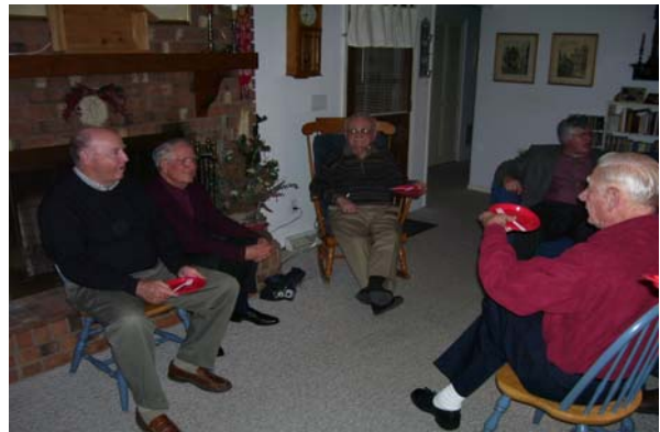
LCGS Men's Christmas Party