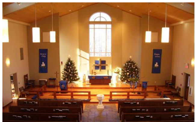
Chancel after tree trimming