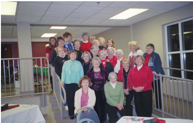
LCGS Women's Christmas Party