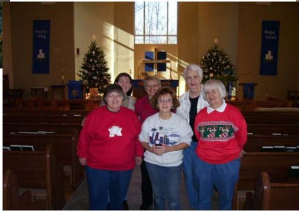
Tree Trimming Group